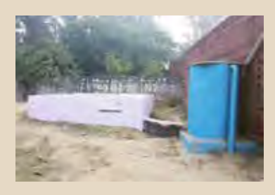
Water Harvesting Project