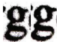
Conventional Printers VarioStream 4000

with easy connection to a wide range of inline finishing systems via industry-standard Type 1 interface