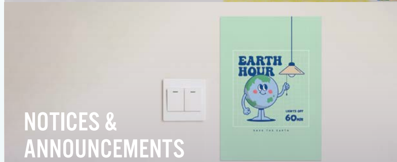
NOTICES & ANNOUNCEMENTS