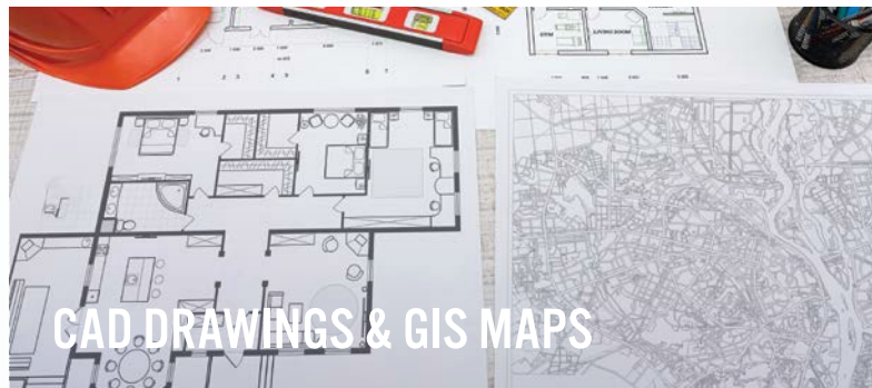
CAD DRAWINGS & GIS MAPS