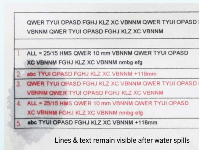
Lines & text remain visible after water spills