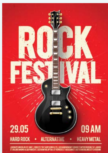
Printed with Vivid Red colour